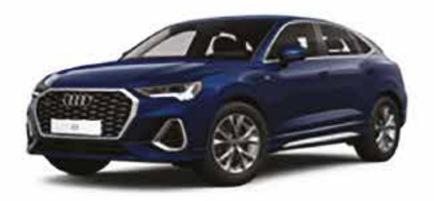
Navarra Blue, Metallic