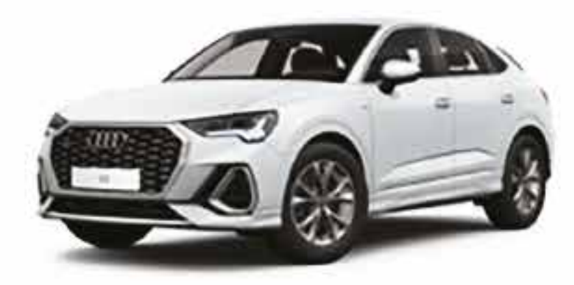
Glacier White, Metallic