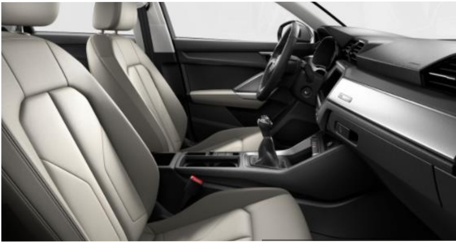
Okapi Brown Pearl Beige