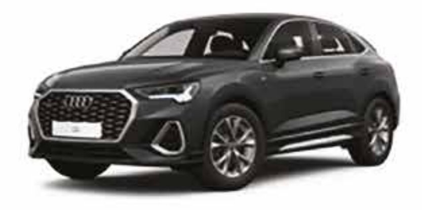
Daytona Grey, Pearl Effect