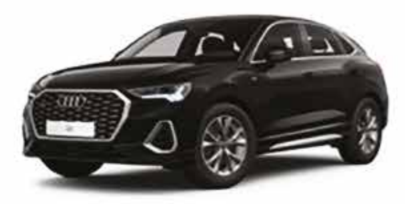
Mythos Black, Metallic