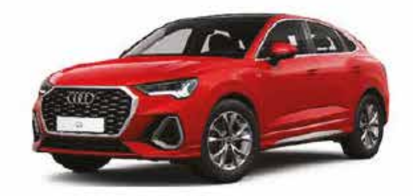
Progressive Red, Metallic

Pick the ideal shade for your Audi Q3 Sportback from our exclusive range of colours.